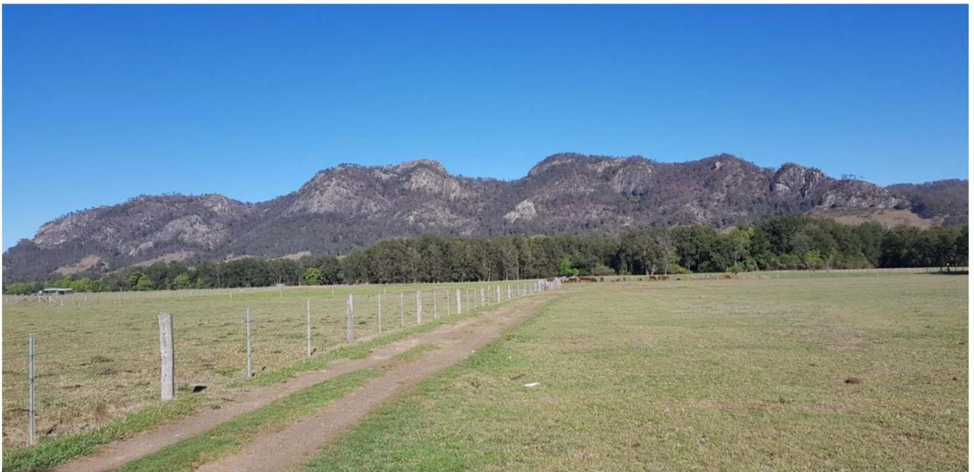
The Bucketts Range – Gloucester NSW.

See overleaf for full details of these optional events